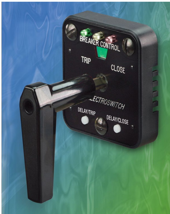
Electroswitch TD-CSR Time Delay Control Switch Relay

evacuate the arc flash area. The unit delays a trip or close operation for 10 seconds following initiation, with an option to easily cancel the pending operation. To prevent inadvertent operation, buttons must be depressed for 4 continuous seconds to activate the 10-second delay. (Other settings are available.)